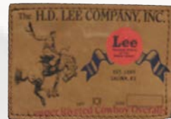
Enlarged Back Patch