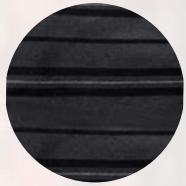
Enlarged Blanket Lining