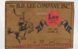
Enlarged Back Patch